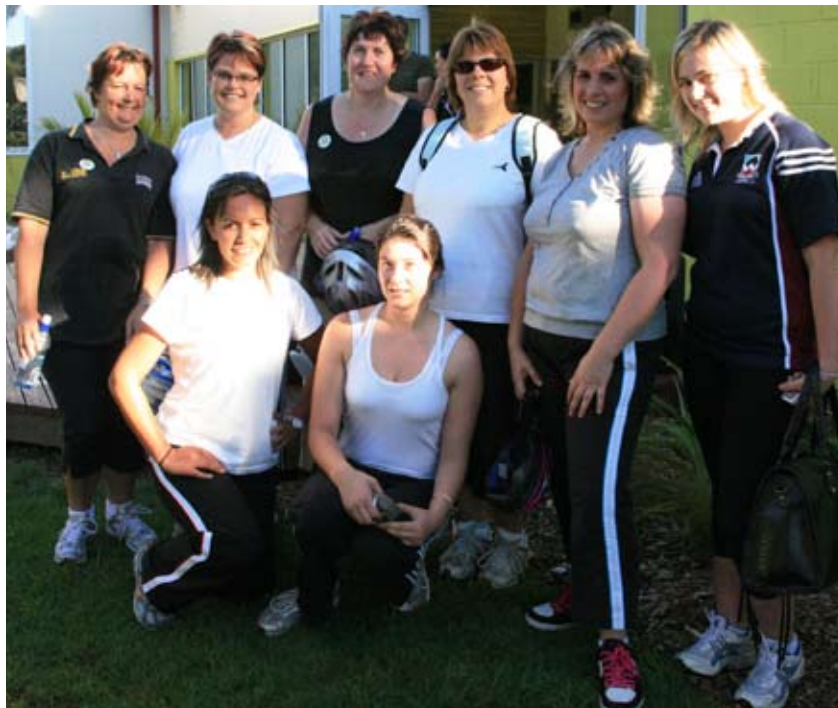
Horowhenua District Council's customer services team - ready to ride