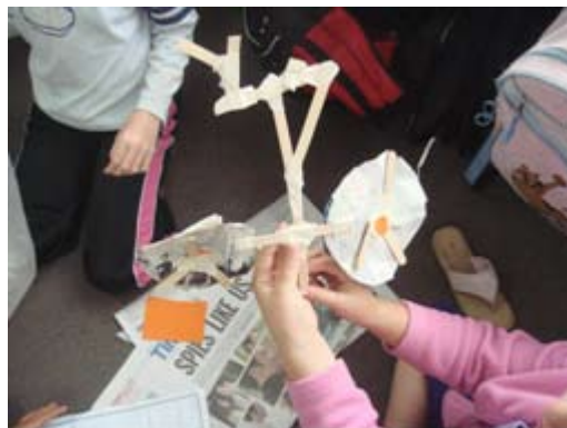
Students show their creative talents, making bikes from newspaper and ice-block sticks