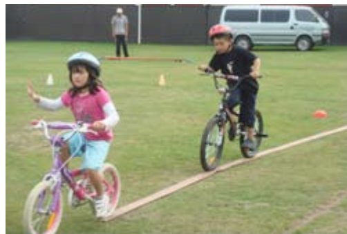
Students practice their bike handling skills and hand signals

We used some of your goodies to provide prizes for the Create a Bike competition and for a Design a Dream Bike competition as well as some being awarded on the day. By the end of the day, although the children were very tired, they had all improved their bike handling skills, knew the importance of wearing a helmet and most could use hand signals.